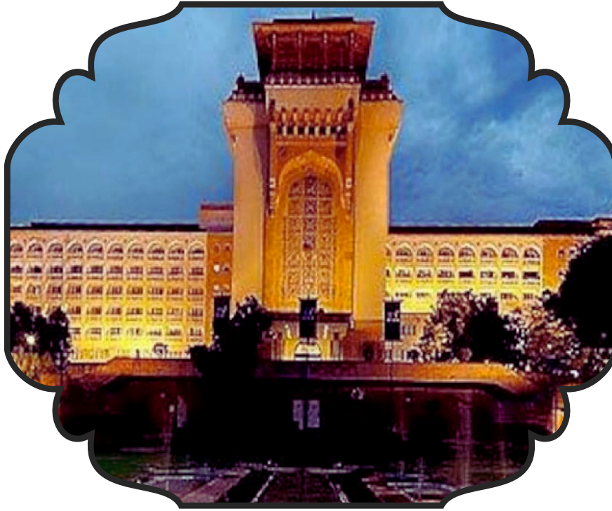
The Ashok Hotel, New Delhi