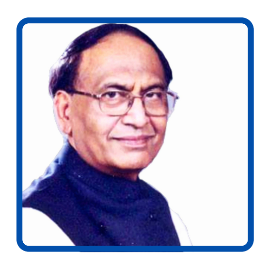
Dr C.P. Thakur FORMER UNION MINISTER, GOVT. OF INDIA